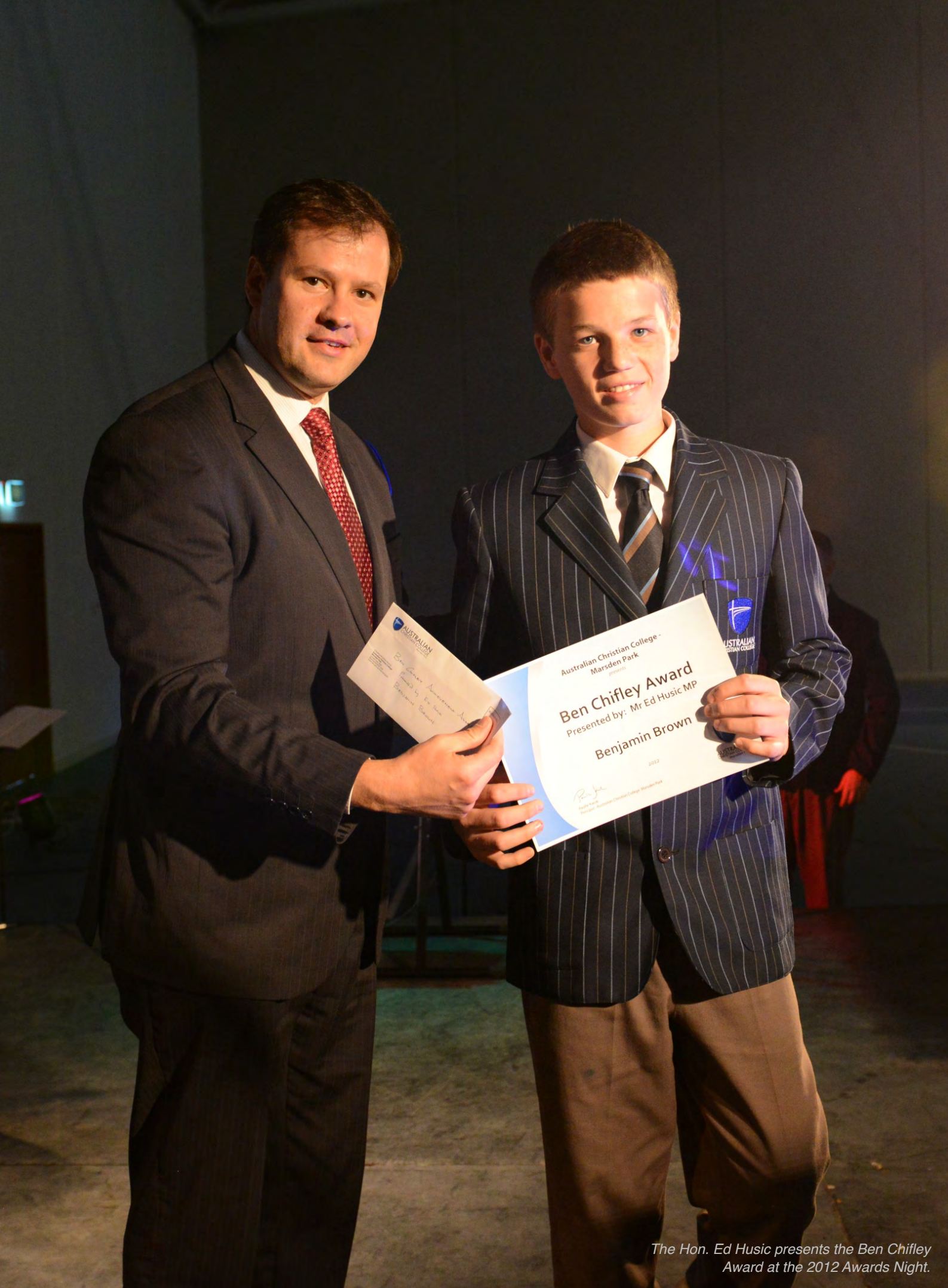
The Hon. Ed Husic presents the Ben Chifley Award at the 2012 Awards Night.